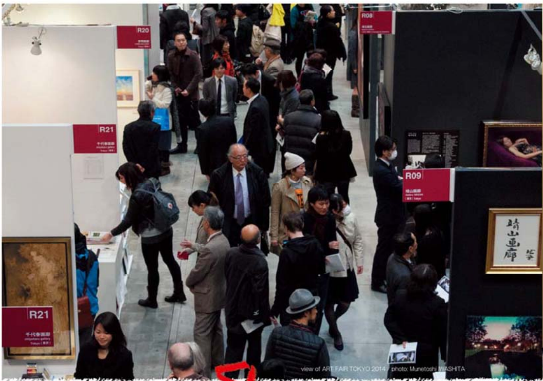
view of ART FAIR TOKYO 2014