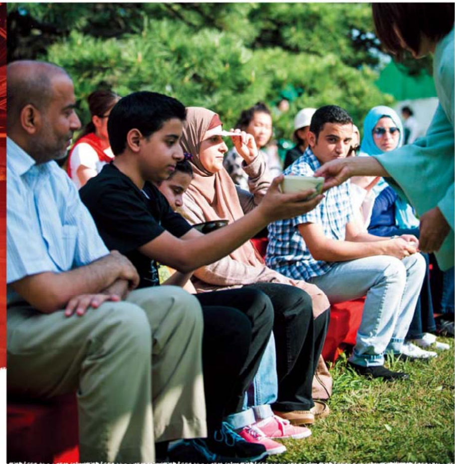
Hama-rikyu Gardens, Nodate, Outdoor Tea Ceremony in English (Tokyo Traditional Arts Program, "Tokyo Grand Tea Ceremony 2014")