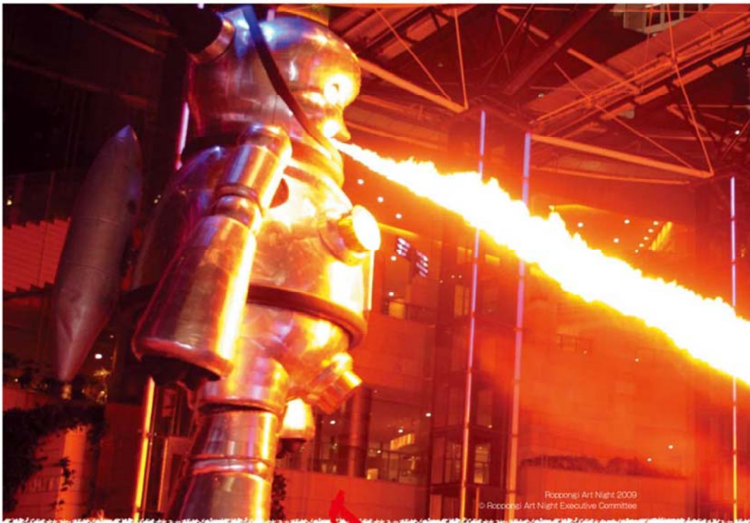
Roccione Art Night 2009