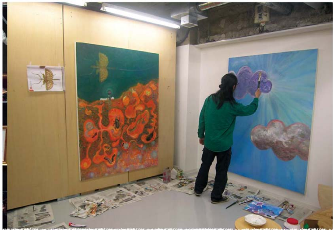
Creative process at an artist-in-residence